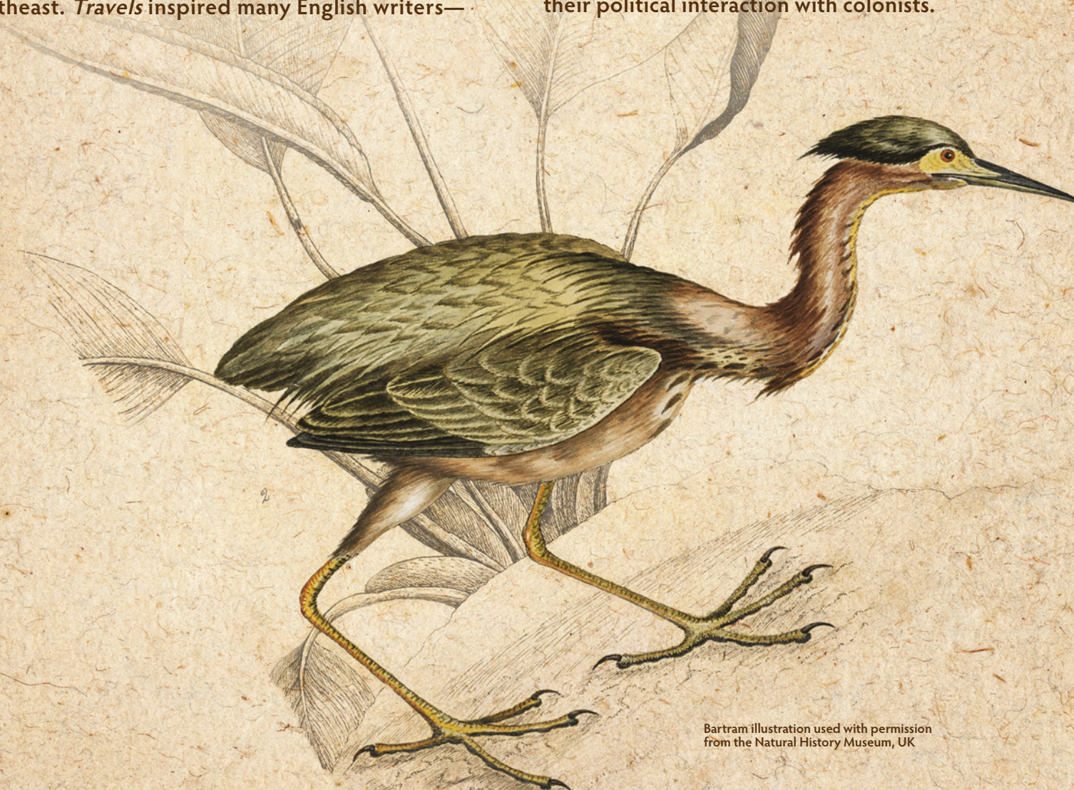
Bartram illustration used with permission from the Natural History Museum, UK