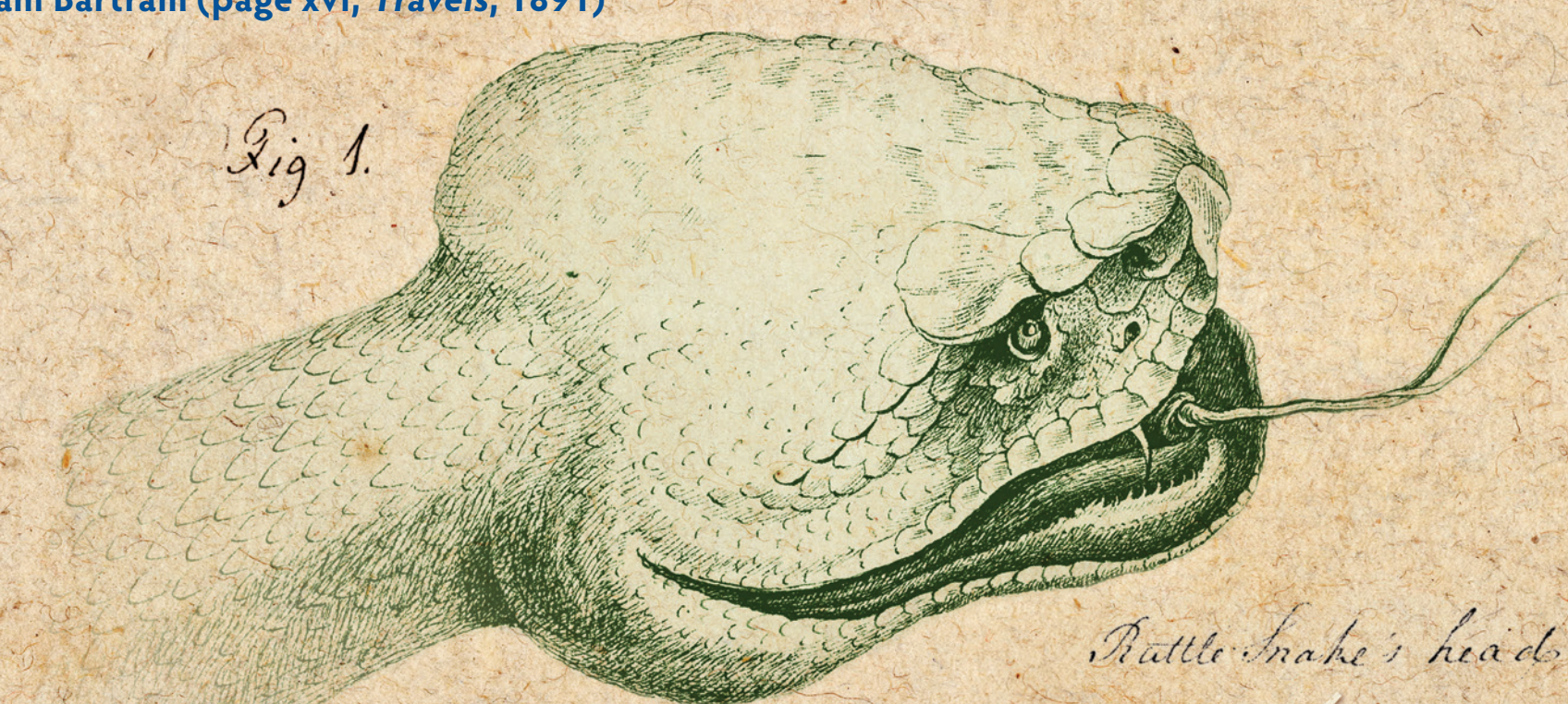
Bartram illustration used with permission from the Natural History Museum, UK