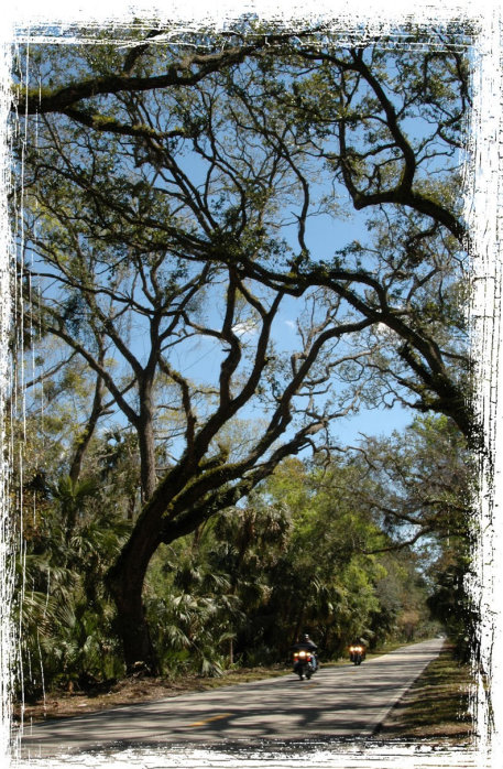
Ormond Scenic Loop