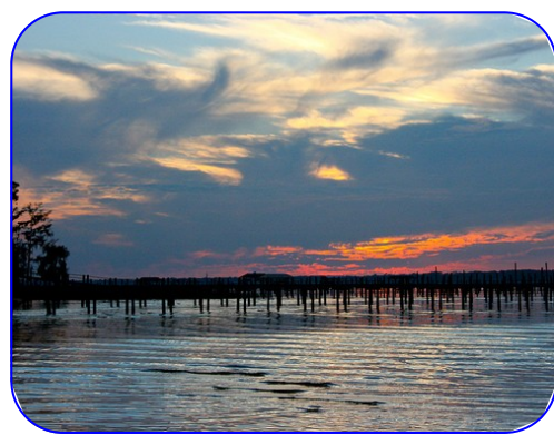
St. Johns River

As the sun rises over the sawgrass marshes that mark the starting point of the St. Johns River, it slices through the mist that defines mornings in swampy central Florida.