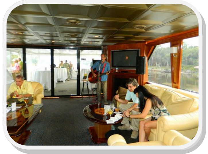
Byway friends A1A celebrating 10 years on the sundancer.

knew it would be a good evening. It was a beautiful time of day and such a nice sunset to be seen while on the cruise. Such a unique way to celebrate such an auspicious occasion—a sunset cruise on the Sundancer stationed on the Intra-coastal Waterway at the Hammock Beach Resort on A1A in Palm Coast. There was entertainment a good musician, a lite fair of scrumptious appetizers and drinks were available but best of all was seeing my ol' friends from A1A. I had been involved since before they were designated. "I can recall way