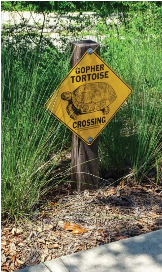
Green Mountain Scenic Highway