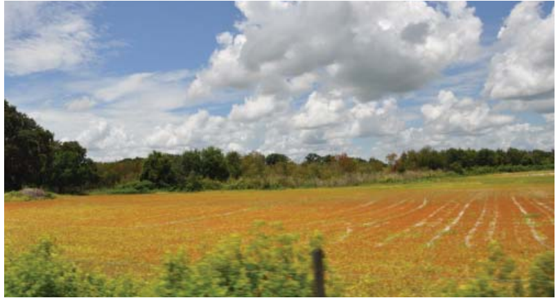
Scenic Sumter Heritage Byway