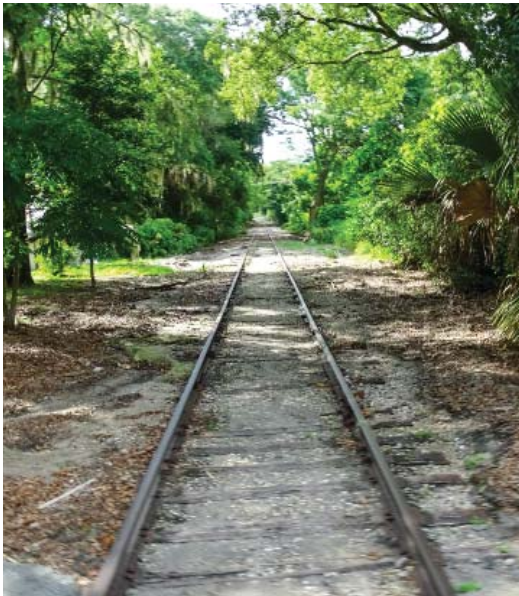
Green Mountain Scenic Highway