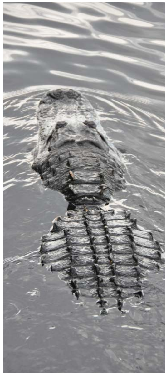
Old Florida Heritage Highway

In September 2019, President Trump signed into law the Reviving America's Scenic Byway Act of 2019. The law re-opened the federal Scenic Byway Program to accept nominations for roads to be designated as National Scenic Byways or All-American Roads.