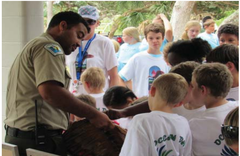
Kids Camp (A1A S&HCB)