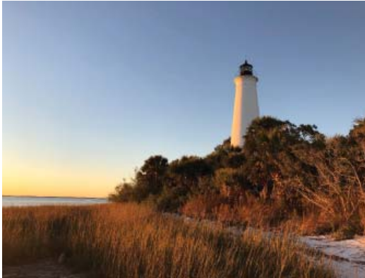
Big Bend Scenic Byway