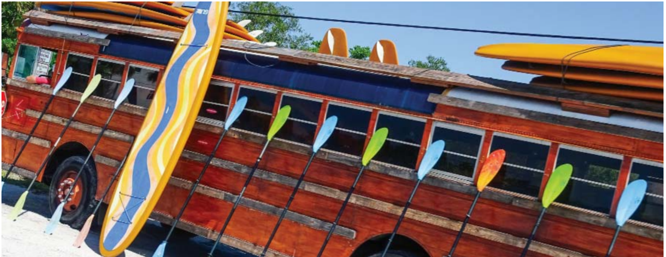
Palma Sola Scenic Highway