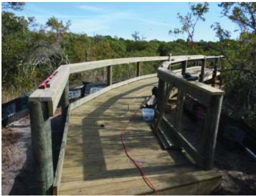
Palma Sola Scenic Highway (PSSH)