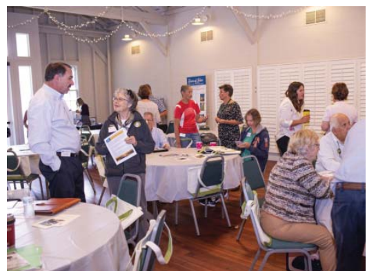
2019 FSHP Statewide Meeting