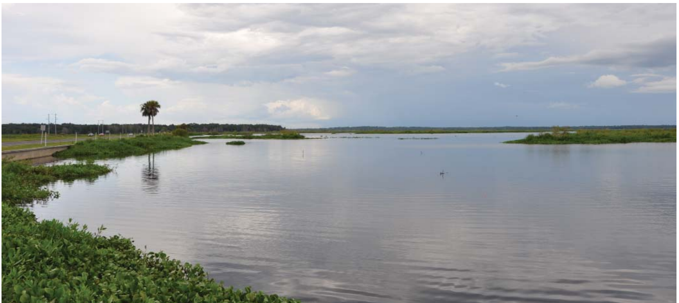
Old Florida Heritage Scenic Highway