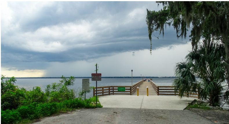
William Bartram Scenic & Historic Highway

In 2019, the Florida Scenic Highway Program purchased a membership with the National Scenic Byway Foundation . By obtaining this membership, Byway Organization leaders and District Scenic Highway Coordinators have access to training materials, while the scenic highways themselves receive national promotion through the Foundation's marketing campaign.