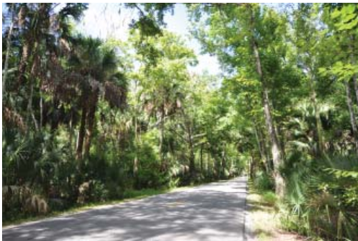
Ormond Scenic Loop and Trail