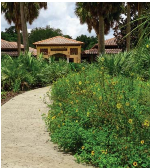
The Ridge Scenic Highway