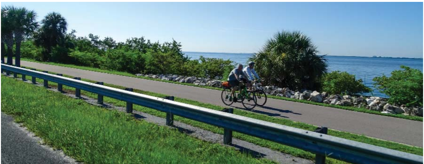
Courtney Campbell Causeway