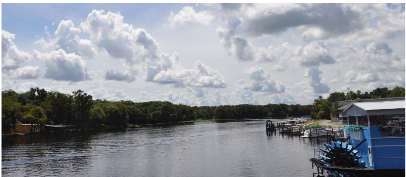
River of Lakes Heritage Corridor