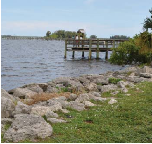
IRL Treasure Coast