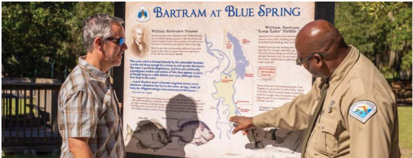
New Interpretive Signage (ROLHC)