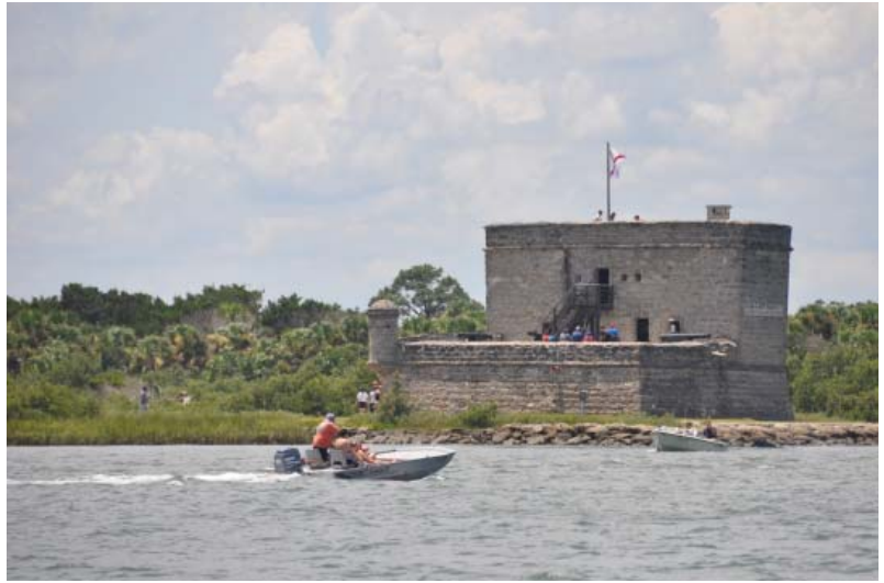
A1A Scenic and Historic Coastal Byway