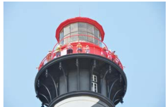
A1A Scenic & Historic Coastal Byway