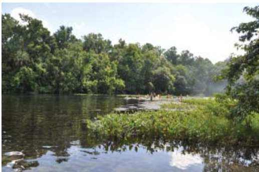
Florida Black Bear National Scenic

The Florida Scenic Highways Program was established in 1996 under the Florida Department of Transportation following the creation of the National Scenic Byway Program. As of 2019, Florida's collection was made up of twenty-six designated Florida Scenic Highways, six of which are National Scenic Byways, and one of these an All-American Road. The scenic corridors are supported by their local Byway Organizations and communities who put countless volunteer hours into promoting and protecting their scenic highways.