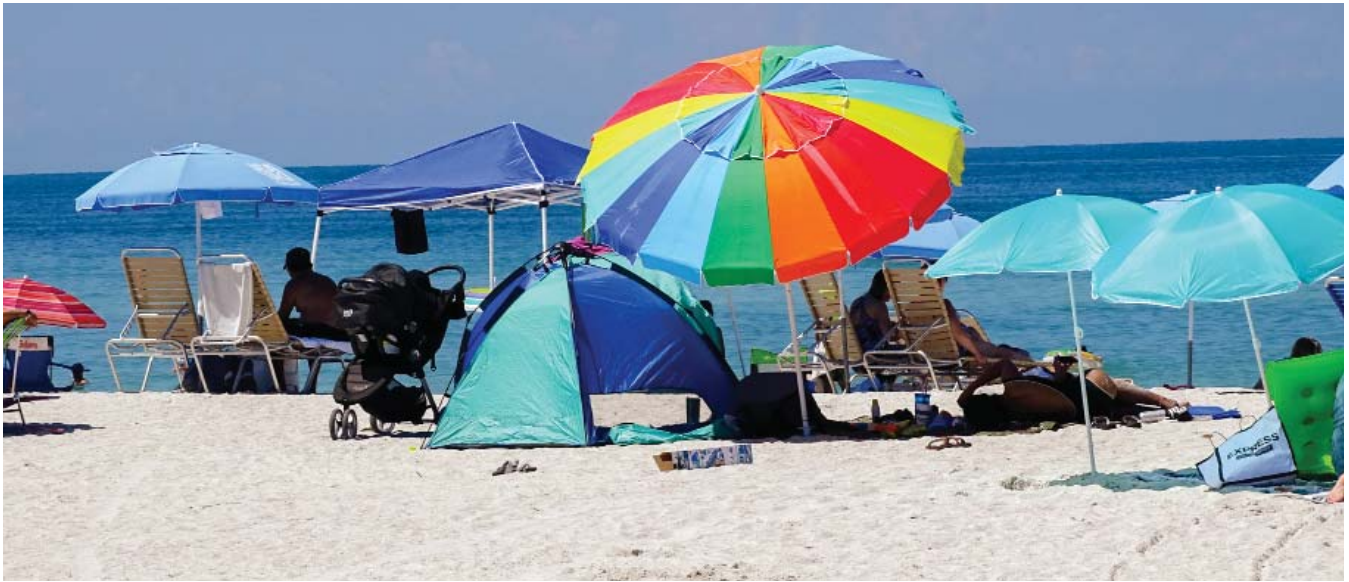
Bradenton Beach Scenic Highway