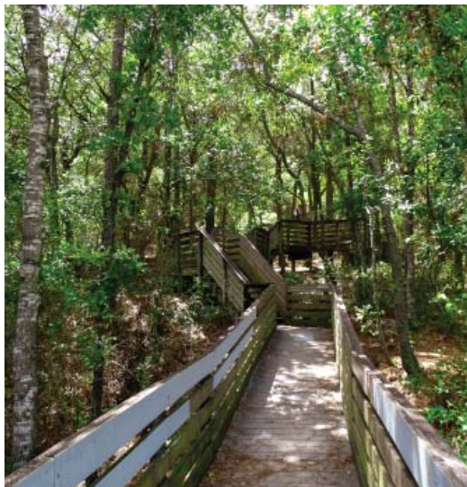
Pensacola Scenic Bluffs