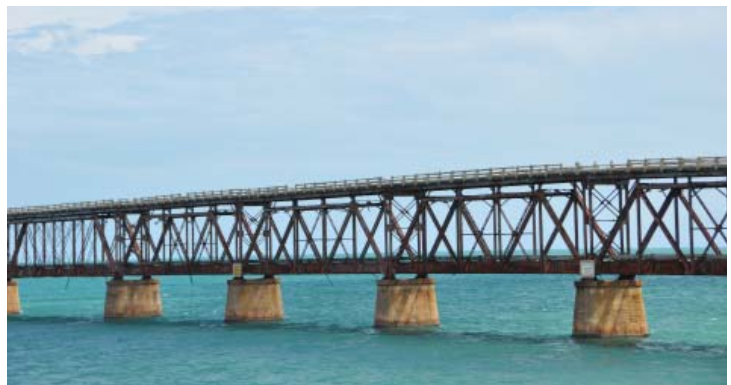
Florida Keys Scenic Highway - All-American Road

In November 2019, Byway Organization leaders and volunteers came together in DeBary, Florida to participate in the 2019 Statewide Meeting where the winner of the Garry Balogh Inspiring Excellence Award was presented. Lastly, the report features Byway Annual Report highlights from eighteen participating byways. We hope this document provides our readers with a meaningful look into the annual activities that have taken place at the national, state, and byway level.