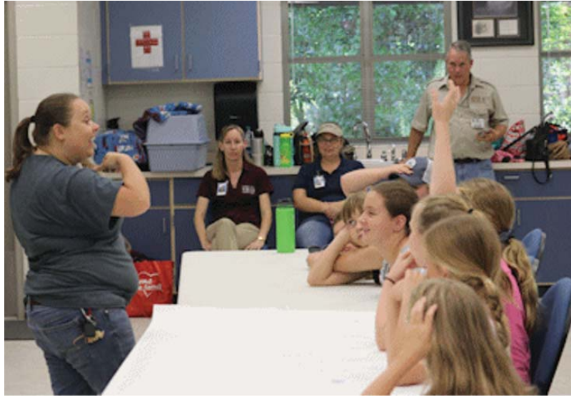
Summer Camp (FBBNSB)