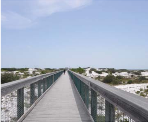
Scenic Highway 30A