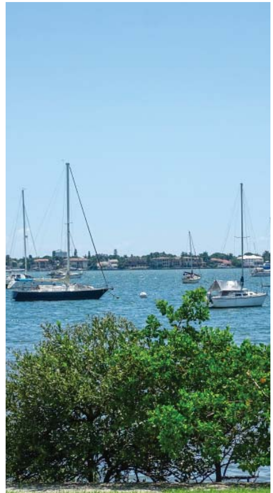
Tamiami Trail: Windows to the Gulf Coast Waters