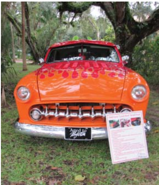
Annual Garage Sale (A1A S&HCB)