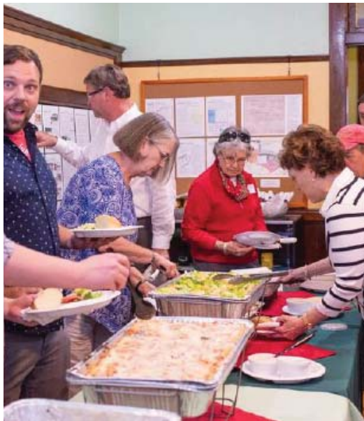
Dinner at Statewide Meeting (ROLHC)