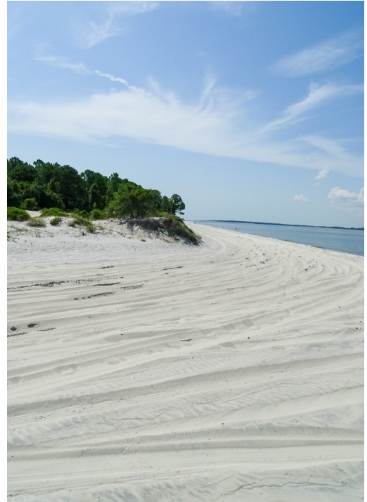
A1A Ocean Islands Trail