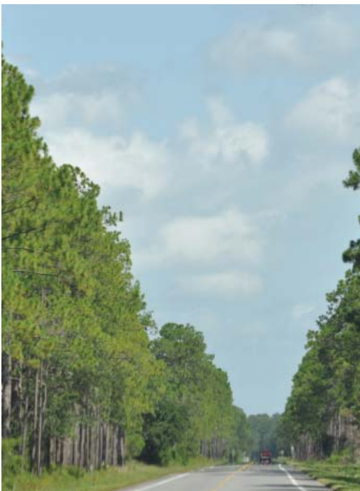
Big Bend Scenic Byway