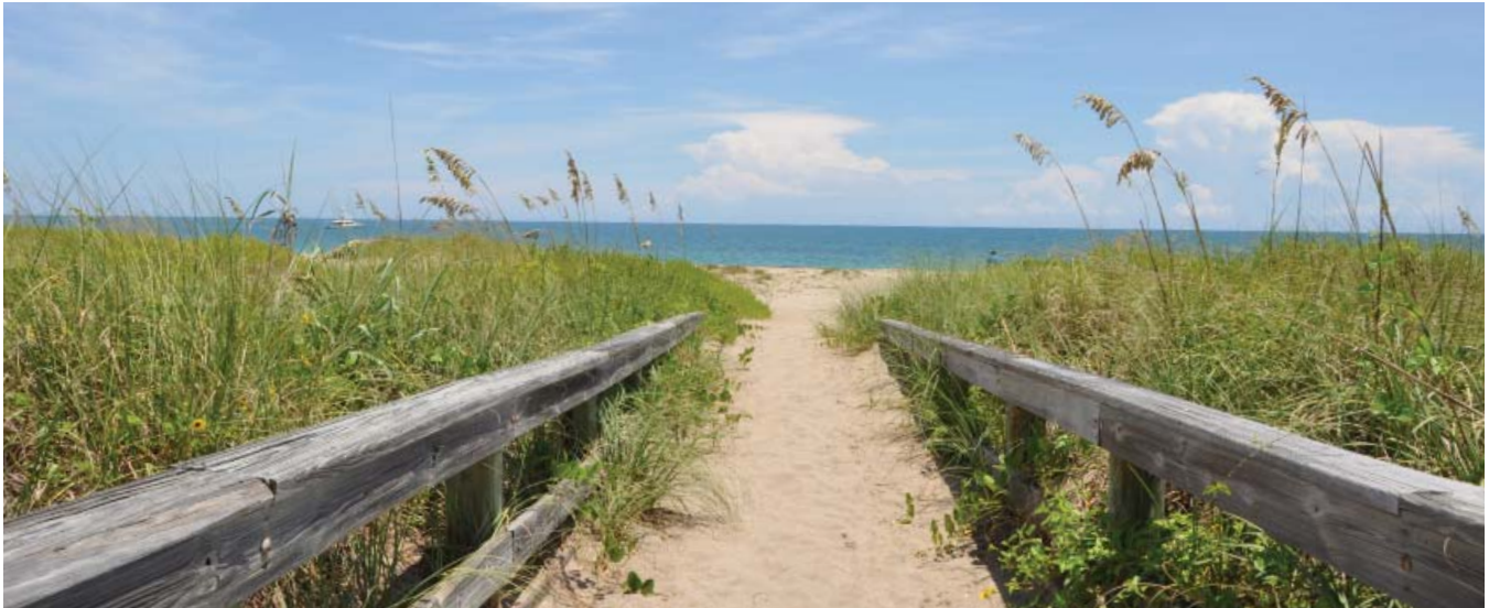
IRL Treasure Coast