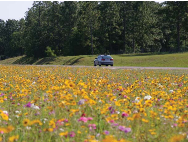
Suncoast Scenic Parkway