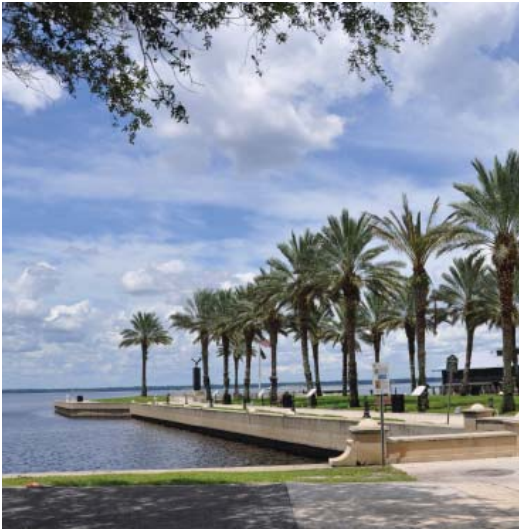
River of Lakes Heritage Byway