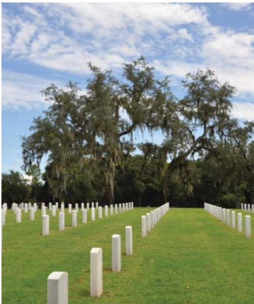
Scenic Sumter Heritage Byway