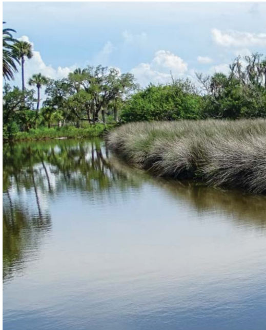
Ormond Scenic Loop & Trail