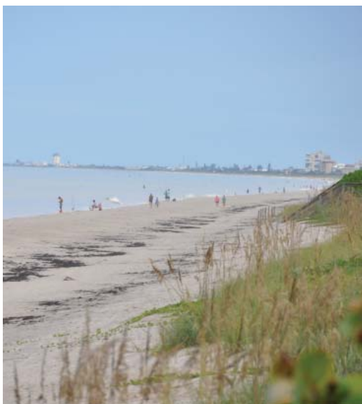
IRL National Scenic Byway