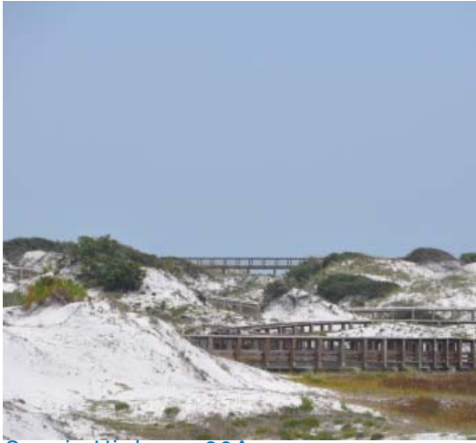
Scenic Highway 30A