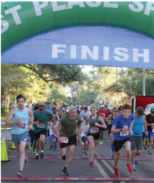
5k Race (JCPSH)