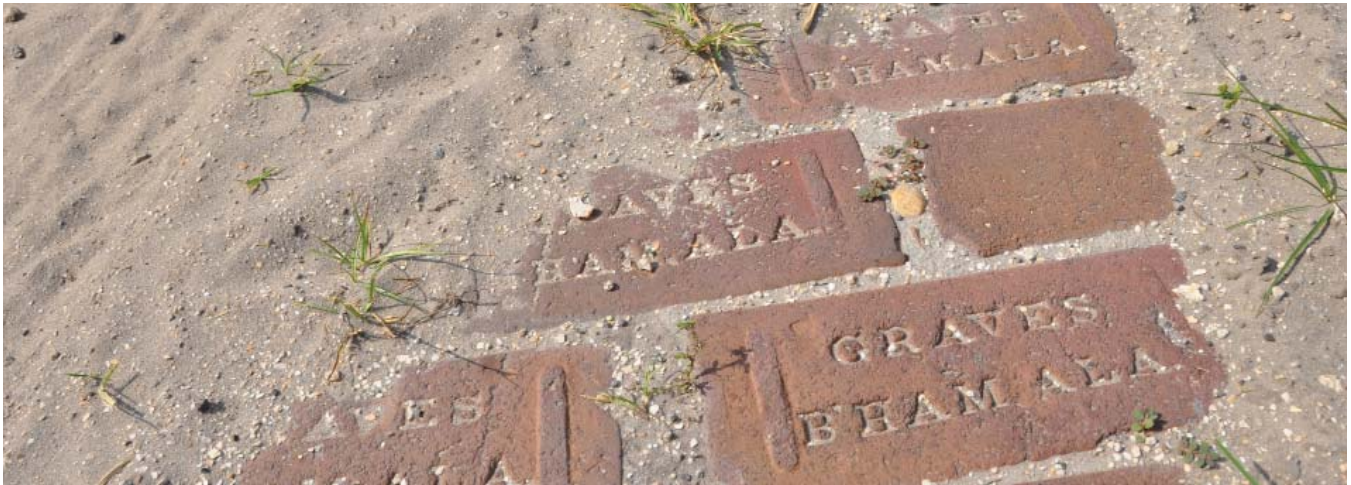
Heritage Crossroads: Miles of History