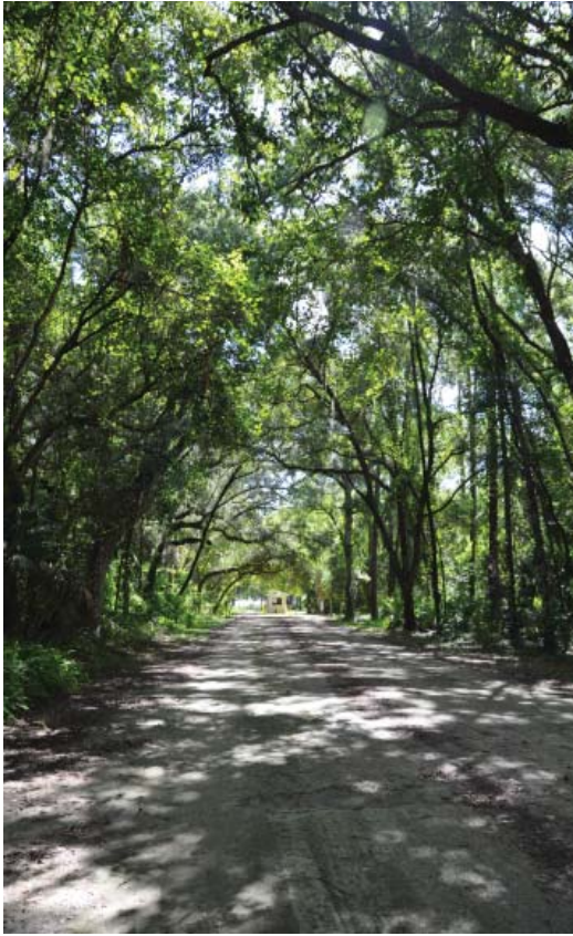
Florida Black Bear National Scenic Byway