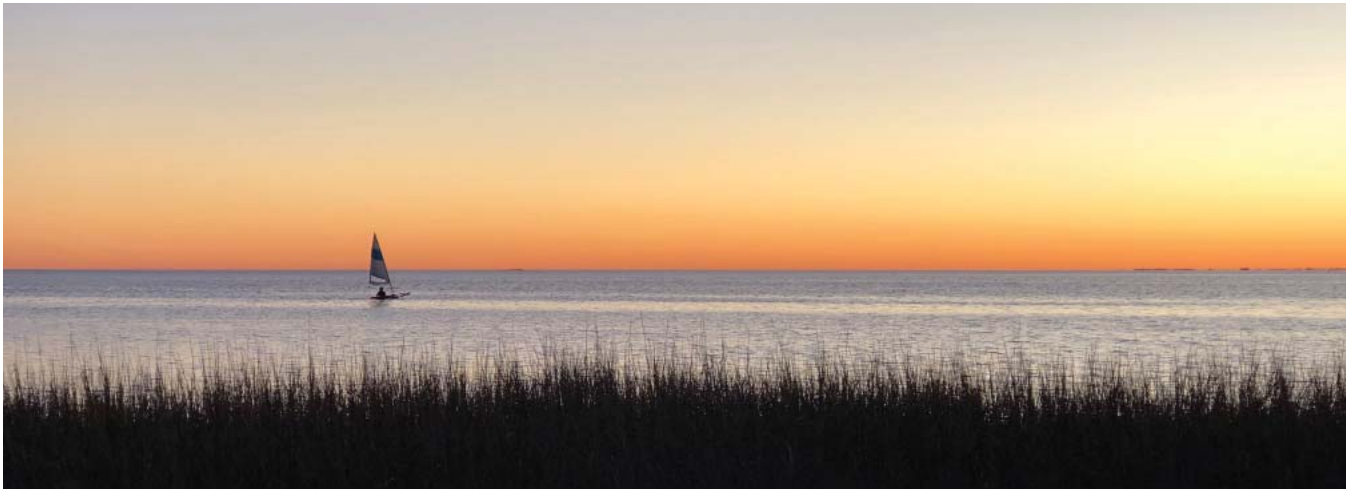
Big Bend Scenic Byway