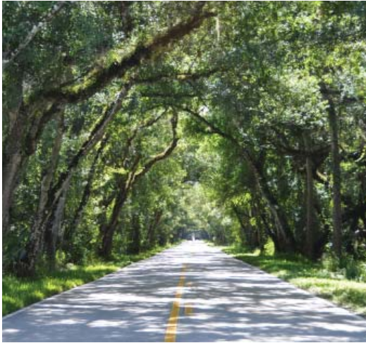
Martin Grade Scenic Highway