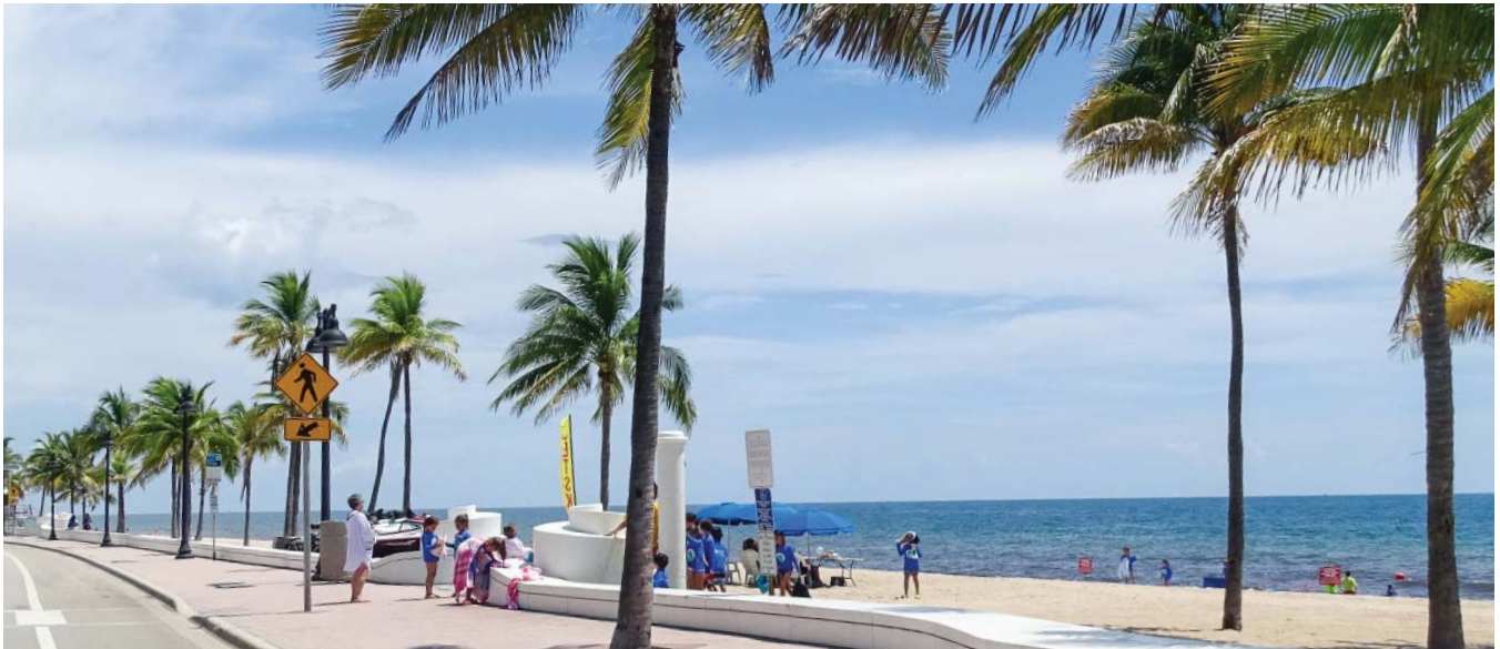
Broward County A1A Scenic Highway

Information on the following pages was gathered from a review of Byway Annual Reports that were submitted for 2019. A total of 18 BARs were submitted: