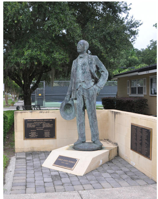
JC Penney Memorial Scenic Highway