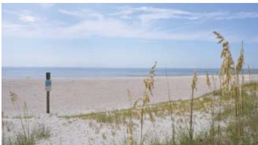
A1A Ocean Islands Trail (A1A OIT)