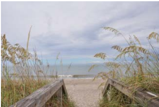
Indian River Lagoon National Scenic