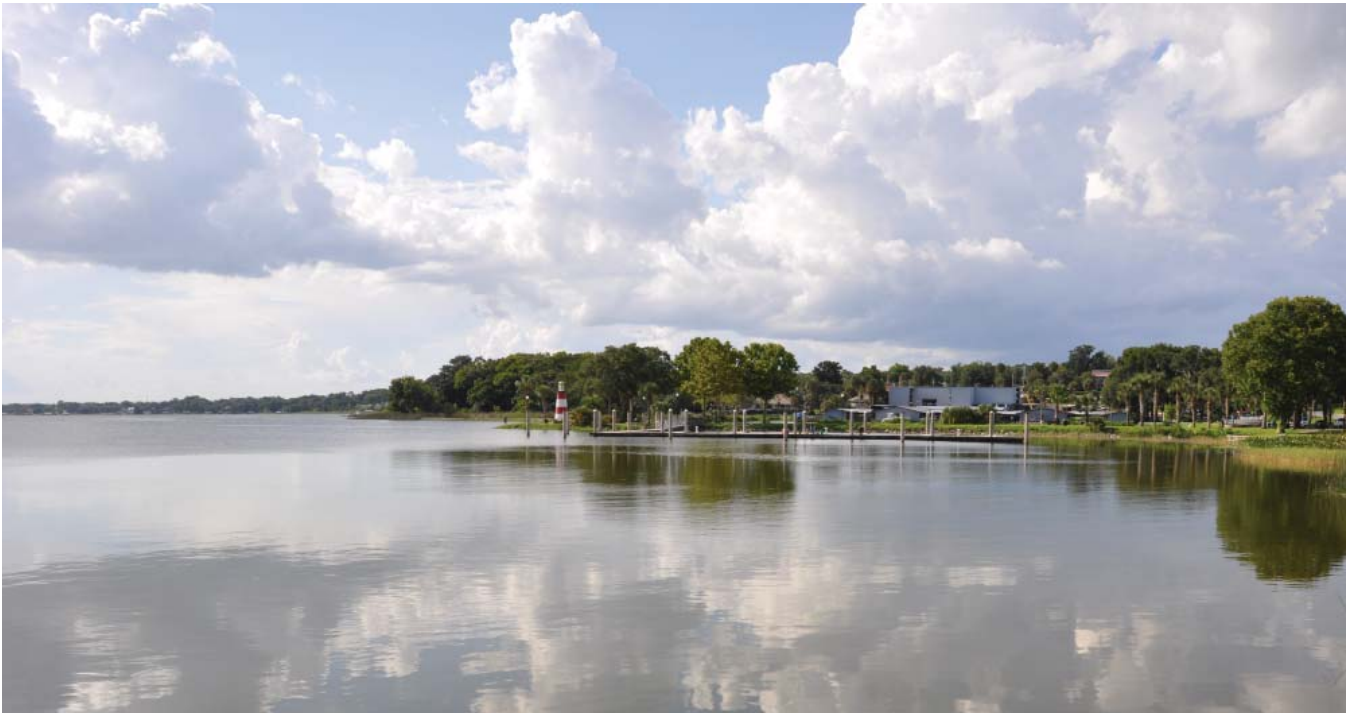
Green Mountain Scenic Byway