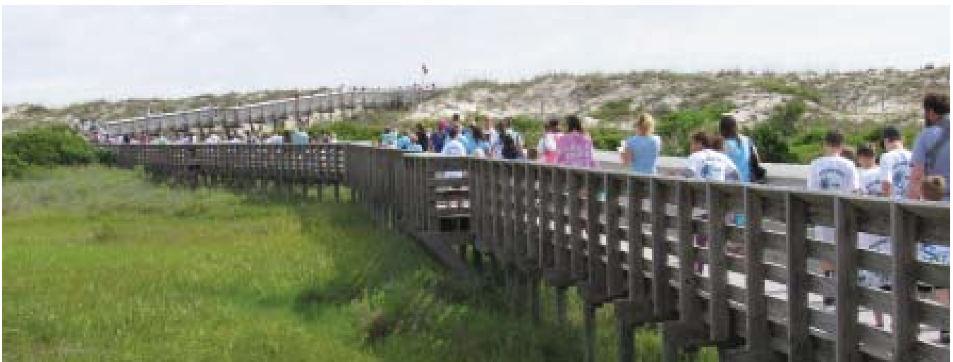
Kids Camp (A1A S&HCB)