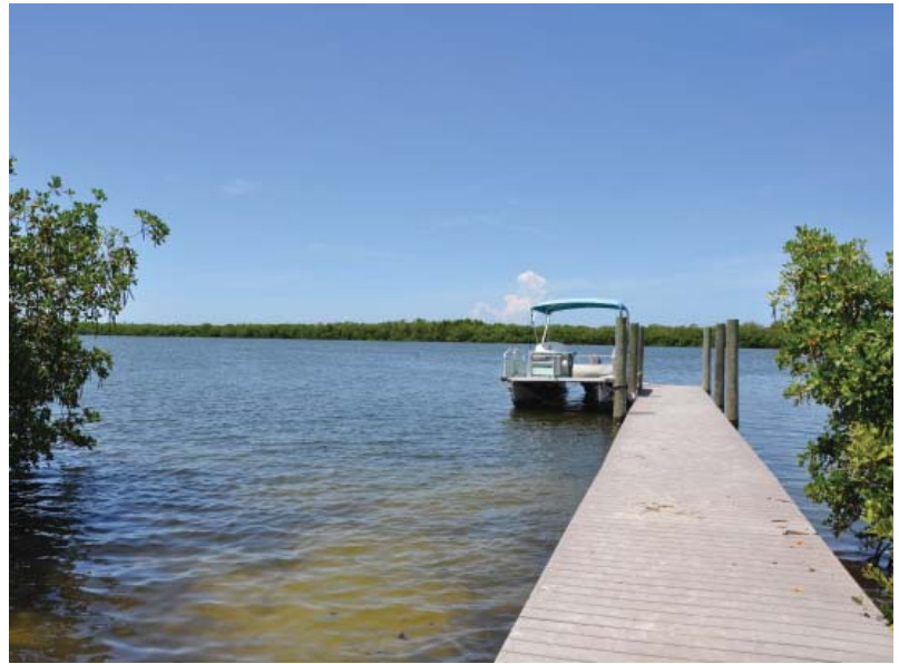
Lemon Bay / Mayakka Trail