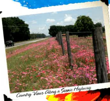
Country Views Along Scenic Highways