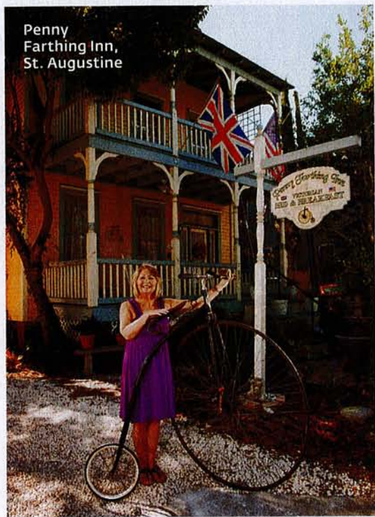
Penny Farthing Inn, St. Augustine