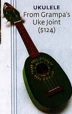
UKULELE From Grampa's Uke Joint ($124)